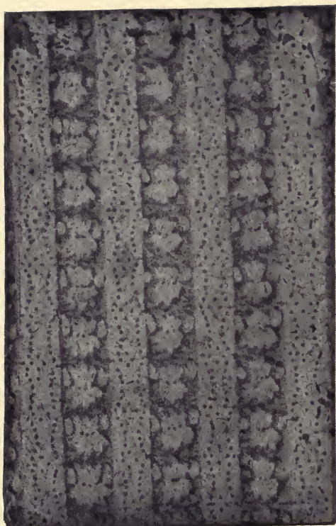
A Wall-paper Book-Cover